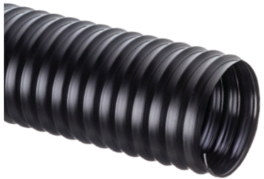
Urevent™ Black URE-BK™ Series Polyurethane Ducting/Material Handling Hose