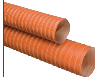
SIL-Duct™ SDH™ Series Silicone Coated, Two-Ply, Woven Fiberglass Ducting Hose With Chemically Treated Steel Wire Helix