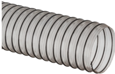
Urevent™ HD UREH-CL™ Series Heavy Duty, Food Grade Polyurethane Ducting/Material Handling Hose