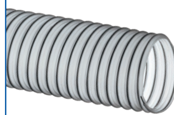
Vinylduct™ Clear VID-CL™ Series Food Grade PVC Ducting/Material Handling Hose