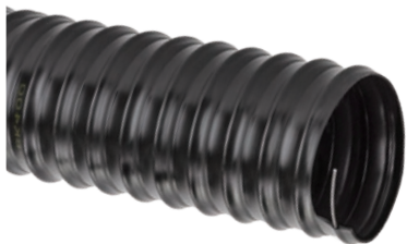
Urevent™ HD Heavy Duty Black UREH-BK™ Series Heavy Duty Polyurethane Ducting/ Material Handling Hose