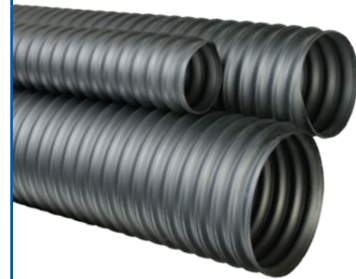
Thermo-Duct™ TMOD™ Series Thermoplastic Rubber Ducting/Material Handling Hose