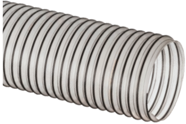
Urevent™ Clear URE-CL™ Series Food Grade Polyurethane Ducting/ Material Handling Hose